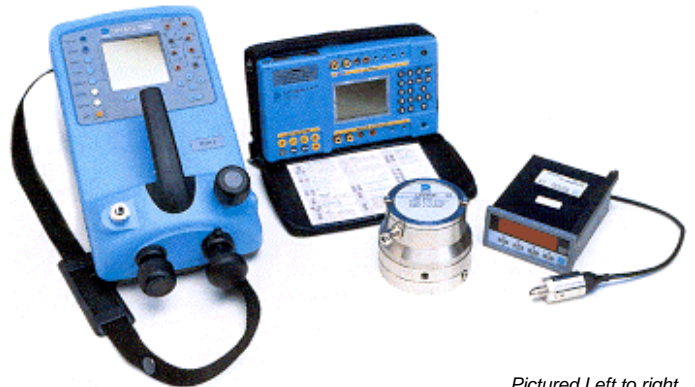
Pictured Left to right DPI 610 Field Portable Pressure Calibrator TRX-II Portable Documenting Process Calibrator LPM 9000 Low Pressure Transducer DPI 280 Digital Process Indicator

Druck manufactures a wide range of pressure transducers and transmitters, associated digital indicators, barometers, and a complete range of precision process calibrators and controllers for the field, workshop and laboratory.